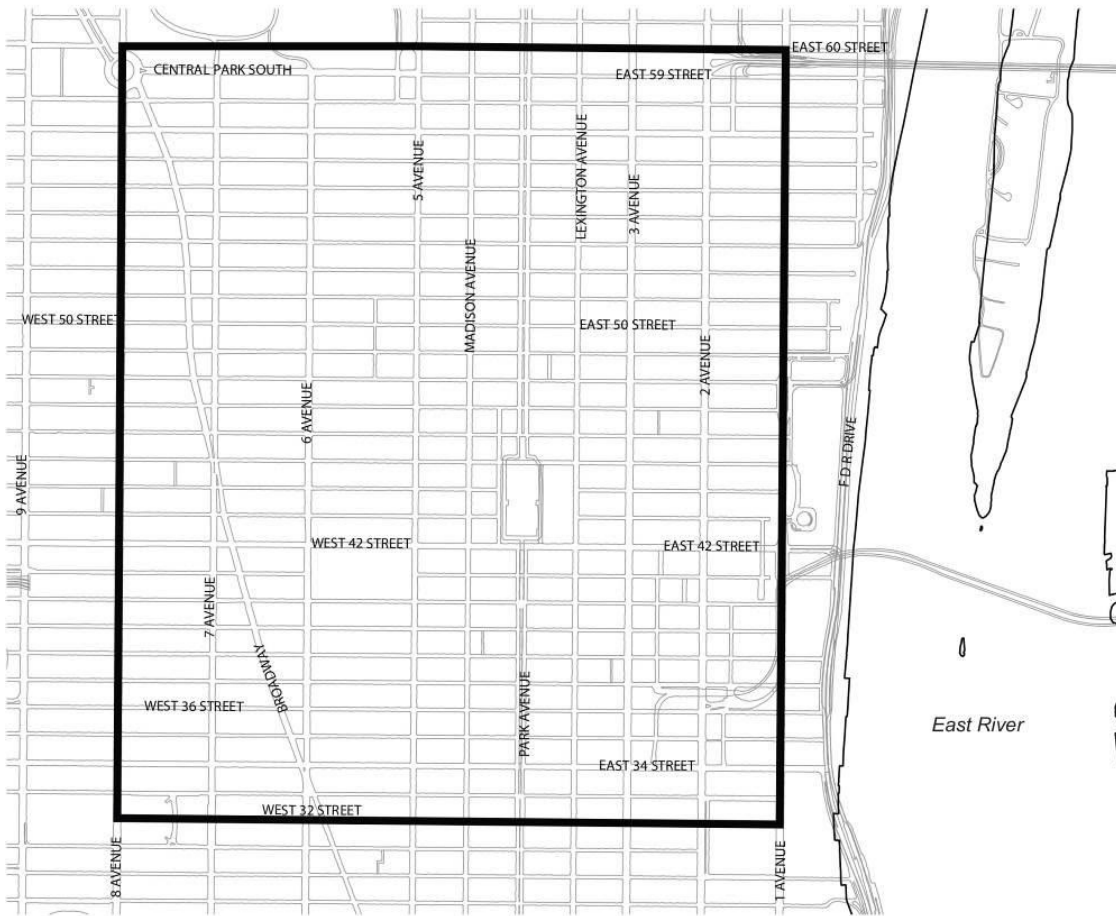
Map 2 — Area where public parking lots are not permitted in the downtown Manhattan Core